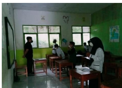
The third meeting conducted learning about vocabulary about objects in the house