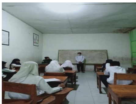
The first meeting in the class to introduce fellow students