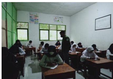
The second meeting distributed pre-test questions to students in knowing students' vocabulary skills